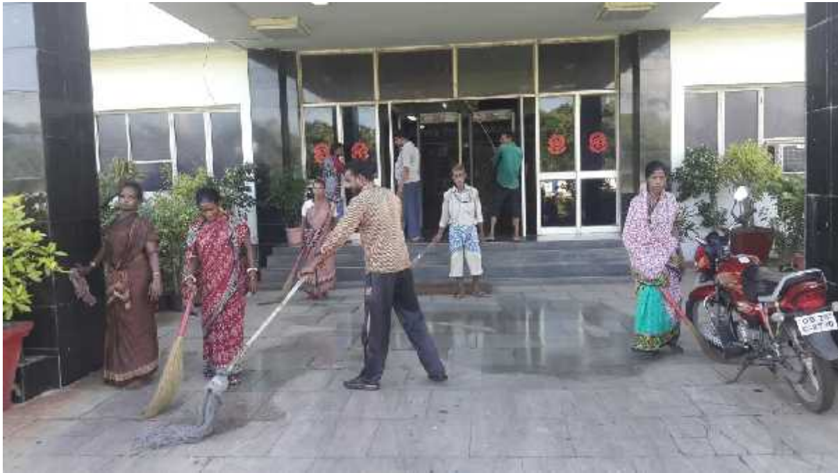
Administrative Building (After)