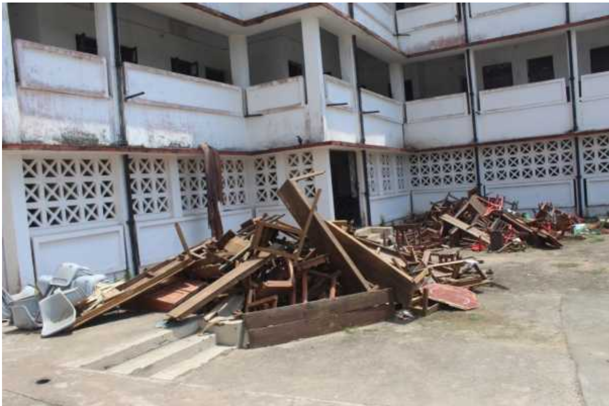
Disposing of piles of old obsolete furniture (After)