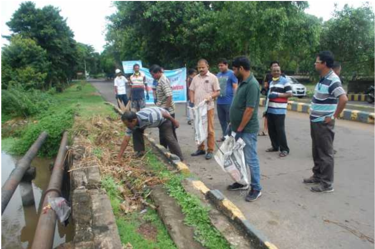
Swachh Bharat Abhiyan by Finance Dept. at Bank Street (After)